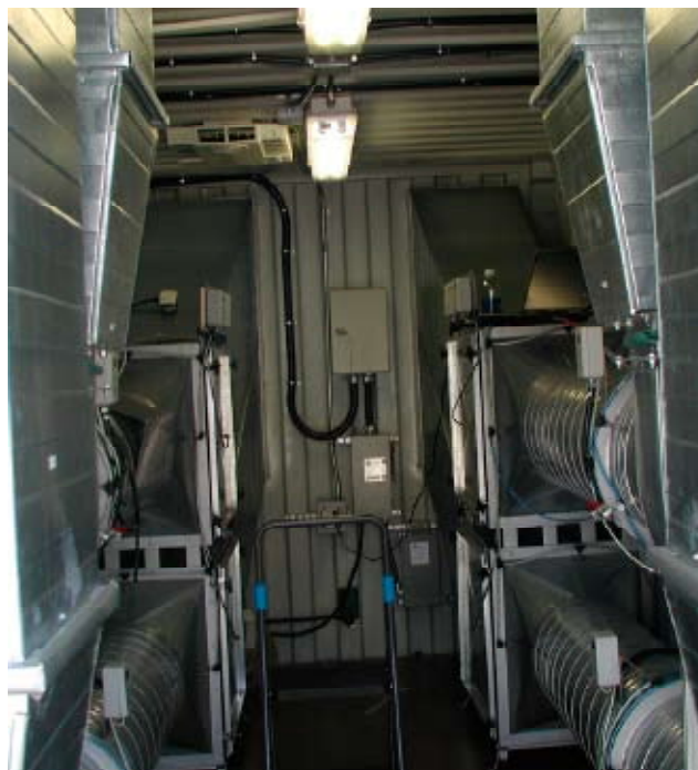
CamField Lab interior - four separate test ducts

Although the filters in Duct 1 and Duct 3 had close efficiencies, there is a clear failure after only 74 days of service. This premature failure would result in higher maintenance costs due to unexpected change outs. The filter in Duct 1 would have the highest energy and total estimated cost because of the rapid increase in resistance and more frequent changes. The filter in Duct 3 seems to have a low energy cost, but the "average resistance" exhibited by the filter is lower than it would be for a normal life span due to the failure after 74 days of service. The filter in Duct 4, although it had a fairly long estimated life based on the field data, lost any advantage with its high resistance to airflow, which made it more costly over the course of its service life. The filter in Duct 2 appeared to be superior in terms of resistance and efficiency, and seemed to be the best choice in terms of cost.