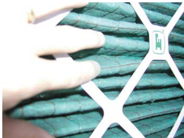
Back of 30/30 after six months