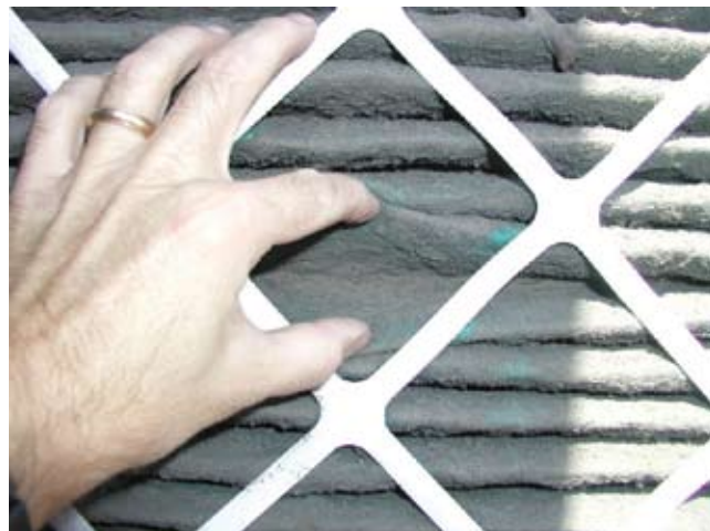
Front of 30/30 after six months