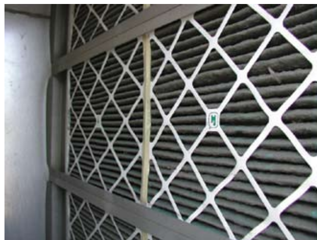
30/30 maintains structural integrity after six months